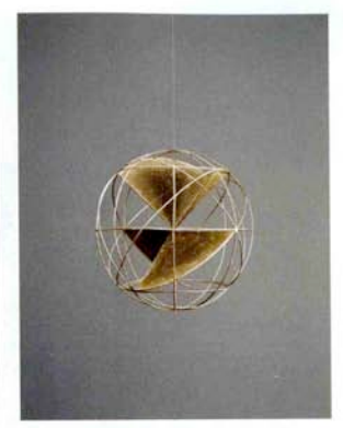
Below: Sharon Lockhart, Four Exercises in Eshkol-Wachman Movement Notation, 2011, color HD video, continous loop. Production still. Ruti Sela.