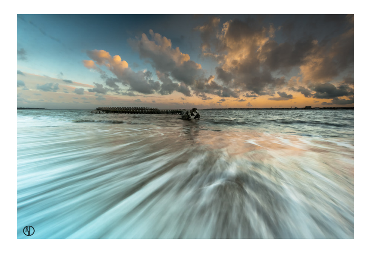
In 2016, the French-Chinese artist created a variation on the theme for his Monumenta exhibit at the Grand Palais in Paris.