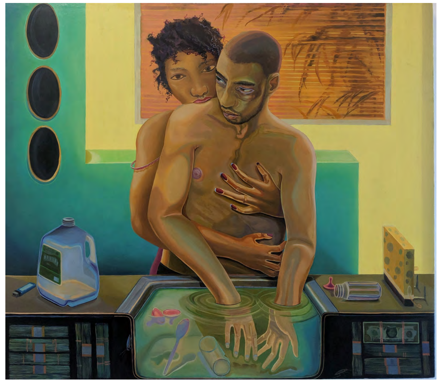
Quiet Storm, 2019

In a way, the work honours everyone's potential. I am always trying to be less messy and pathetic than I was the day before! There is a lightness of touch to the work too, but I want to lead a meaningful life and this is me trying to unlock that. The dream would be to have the work be a roadmap so that other people could find a way to do that too.