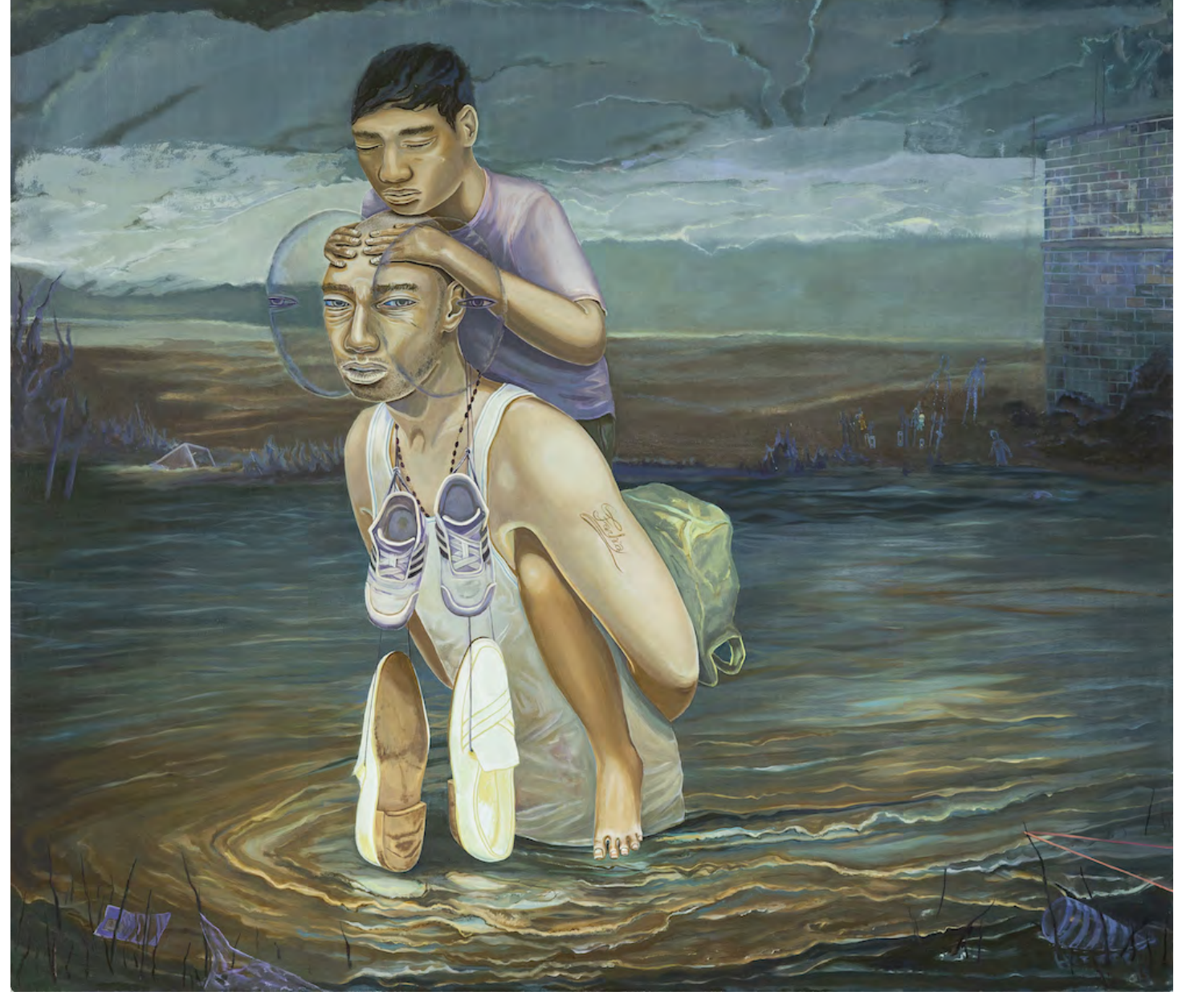
Song to the Siren, 2020

I am really intrigued by the way you create compositions. You depict quite naturalistic scenes, but there are often <u>surreal</u> or unexpected elements within these. Do you take a lot of inspiration from observing moments and interactions in real life?