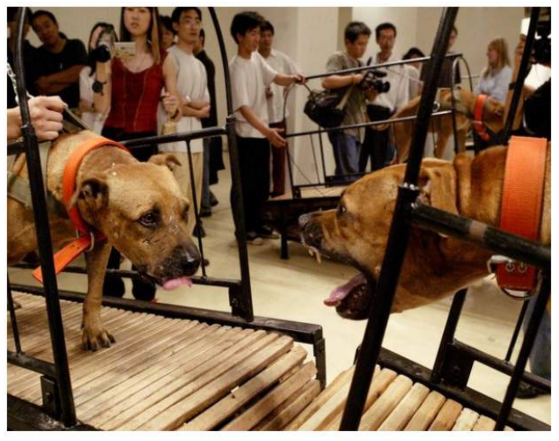
Sun Yuan and Peng Yu's "Dogs That Cannot Touch Each Other," 2003, a seven-minute video with eight American pit bulls on eight treadmills.

Soon after the opening at the Guggenheim, the Communist Party will hold its <u>national congress in Beijing</u>, a conclave set to anoint the current president, Xi Jinping, for a second term. The uninhibited avant-garde art at the Guggenheim will offer a jagged contrast to Mr. Xi's stiff <u>internet</u> censorship, and repression of human rights that keeps some of China's artists — including perhaps the best known, Ai Weiwei — from living and working in their homeland.