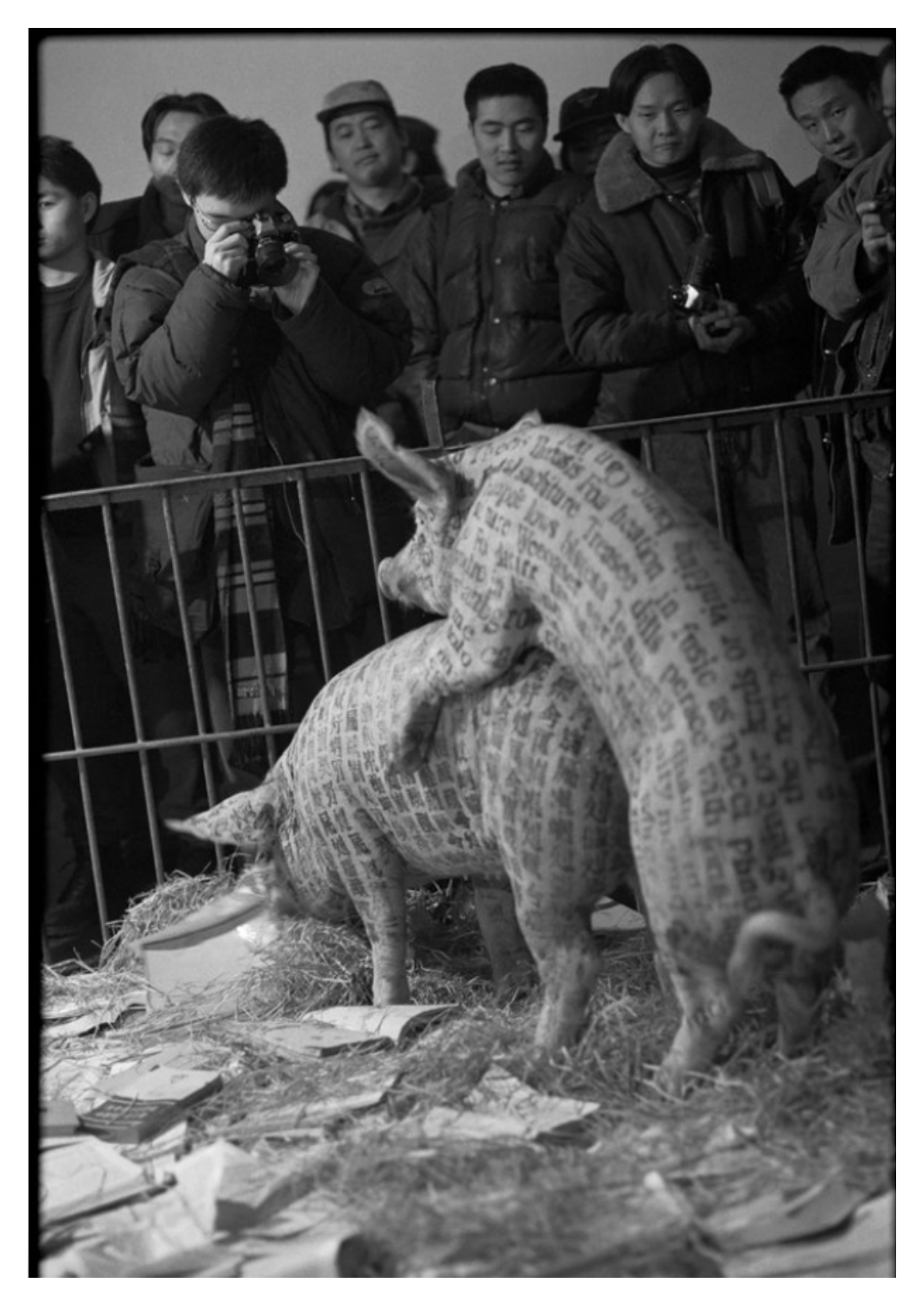
Xu Bing's "A Case Study of Transference," 1994. The artwork originally featured live pigs, their backs stamped with gibberish. The Guggenheim settled for a video of the Beijing performance. XU BING

Ms. Peng revels in her brazen politically incorrect attitudes. The fuss about too few female artists in the Guggenheim show was unjustified. "Personally I think female artists in China are not as hard-working as male artists and their art is not as good as male artists," she said.