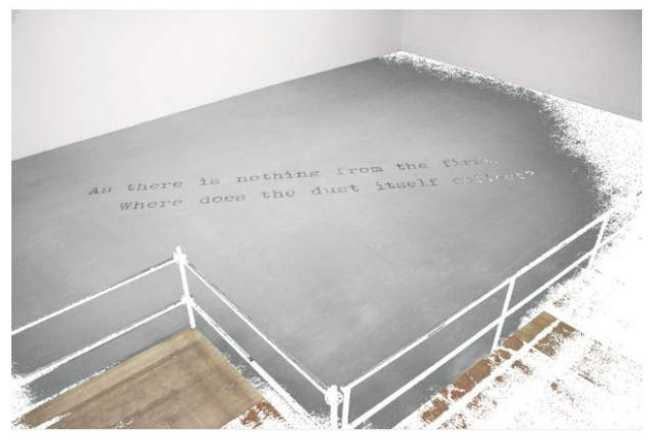
Xu Bing gathered dust from the 9/11 site in Lower Manhattan for his 2004 artwork "Where Does the Dust Itself Collect?"

His work, "A Case Study of Transference," from 1994 illustrates his fascination with the ugly and the primitive versus the beautiful and the classical.