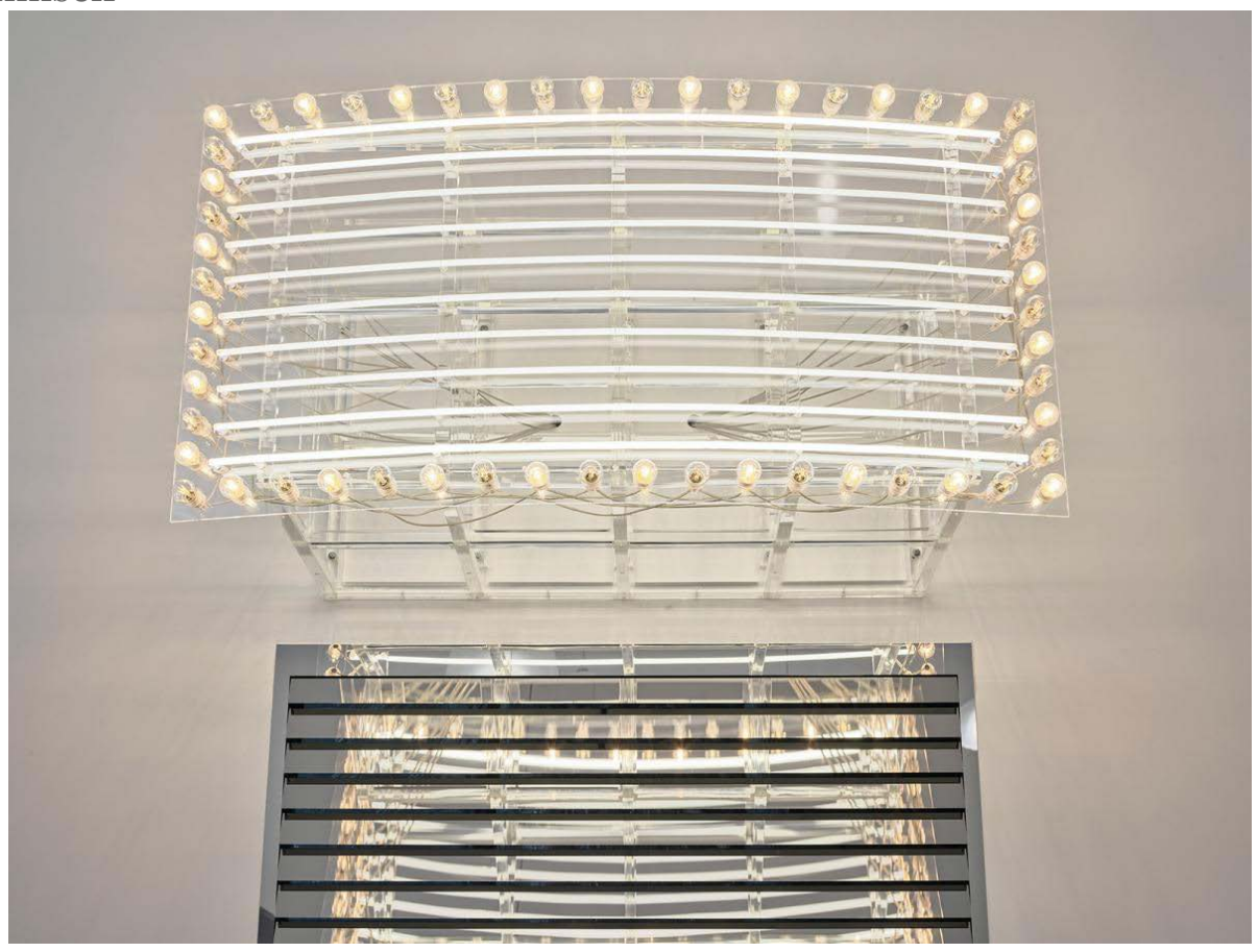
Detail of Echo , 2019, by Philippe Parreno, installation view at The Museum of Modern Art, New York.

The French artist has created a site-specific installation for the entrance of the New York art museum. Here, we go behind-the-scenes with an exclusive interview, and photographs captured by Parreno himself