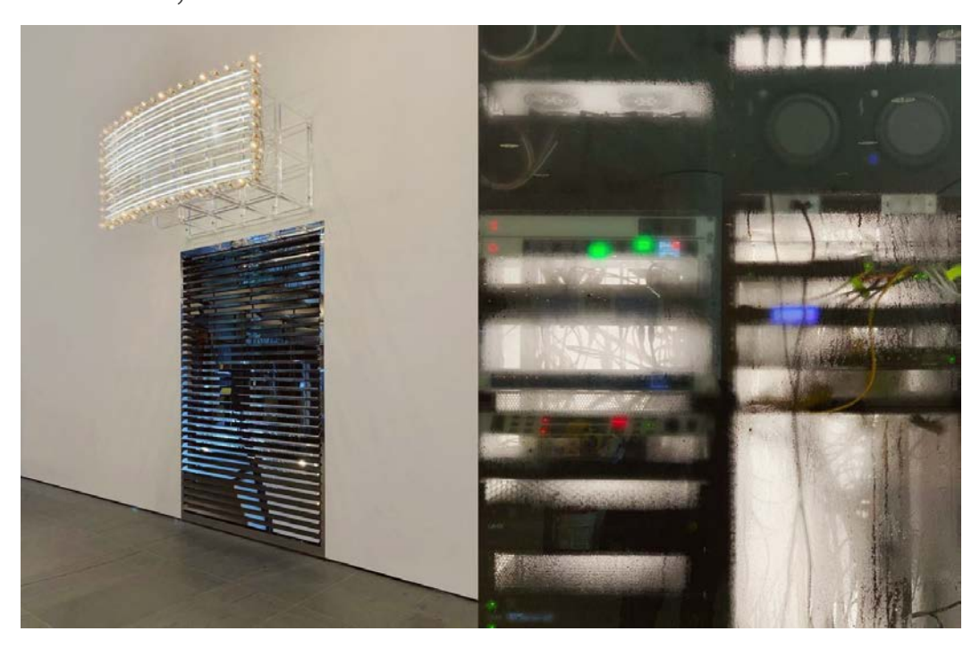
Echo , 2019, by Philippe Parreno, The Museum of Modern Art, New York. © The artist. Photography: Philippe Parreno

Parreno states, 'I didn't want to use any mathematical equations or algorithms, so everything is really linked to perception. It's a creature that reflects what it perceives and when it perceives more than one thing, it produces another operation – the movement of a light or the strength of the light. It's an echo, which is the title of the work.'