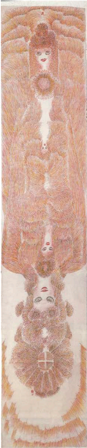
Guo Fengyi, Statue of Liberty , 2003. Colored ink on rice paper, 198 7/8 x 38 1/4 inches.