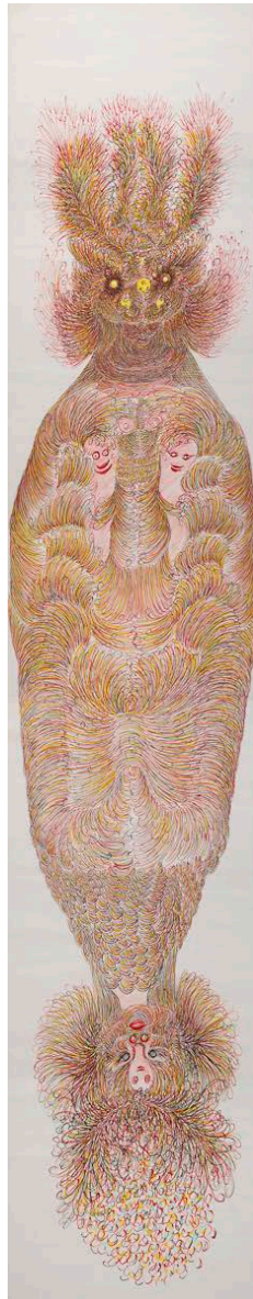
Guo Fengyi, Niwa , 2005. Colored ink on Xuan paper, 162 7/8 x 27 5/8 inches.

pinned to the dark gray walls of the locked gallery. And though the short video tour, which alternates silent views of the room and tracking shots of individual compositions, has all the charm of drone footage with its smooth scrutiny, its close-ups are far better than what I have haphazardly captured of Guo's numinous work with my phone in the past.