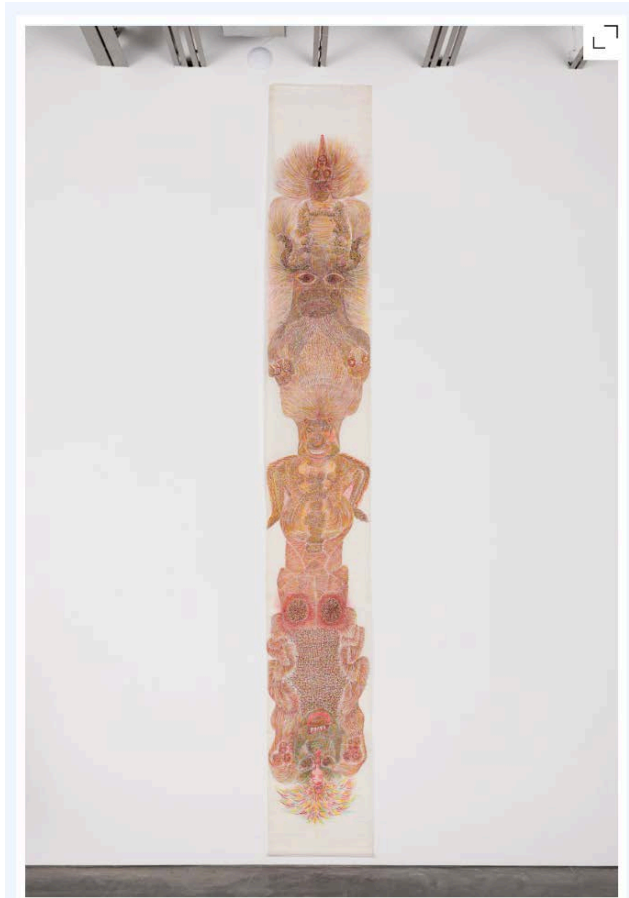
Guo Fengyi, Yamantaka , 2005. Colored ink on rice paper, 278 × 37 7/8 inches.

Guo sat at a rather small table to make these large pieces, which is hard to believe, and yet obvious once you think about it. Built from consecutive passages of rhythmic calligraphic marks, each of the supernatural figures has a meandering structure and a vibrating radiance. Yamantaka (2005), named for the wrathful Tibetan deity, is an outlier for its fearsome aspects—the monstrous figure’s upside-down, bottommost head grimaces with a fanged underbite—but otherwise it’s typical of Guo’s approach. The sunset-hued strokes that form the volumes of Yamantaka ’s many faces and long body read alternately as hair, fire, and pure energy; the scroll’s off-kilter composition, which would have been visible to her only in tabletop-sized pieces as she worked, embodies that thrilling moment, I imagine, when the triumphant sum of her fragmented focus was first revealed.