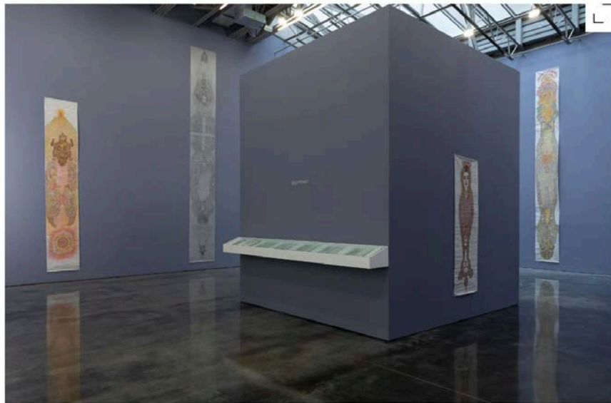
Guo Fengyi , installation view.

Scrolling the scrolls: a cyber look at the late artist's large drawings.