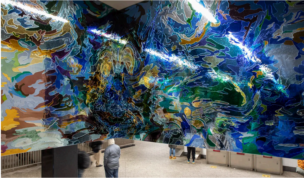
Artist Jim Hodges's permanent installation I dreamed a world and called it Love at New York's Grand Central Terminal

The expansive installation, created by artist Jim Hodges, was made of more than 5,000 separately cut pieces of colored glass.