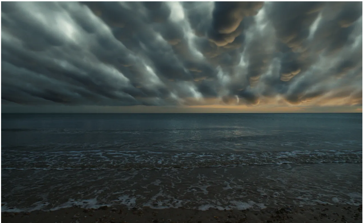
Mark Leckey, DAZLEDDARK , 2023 (production still)