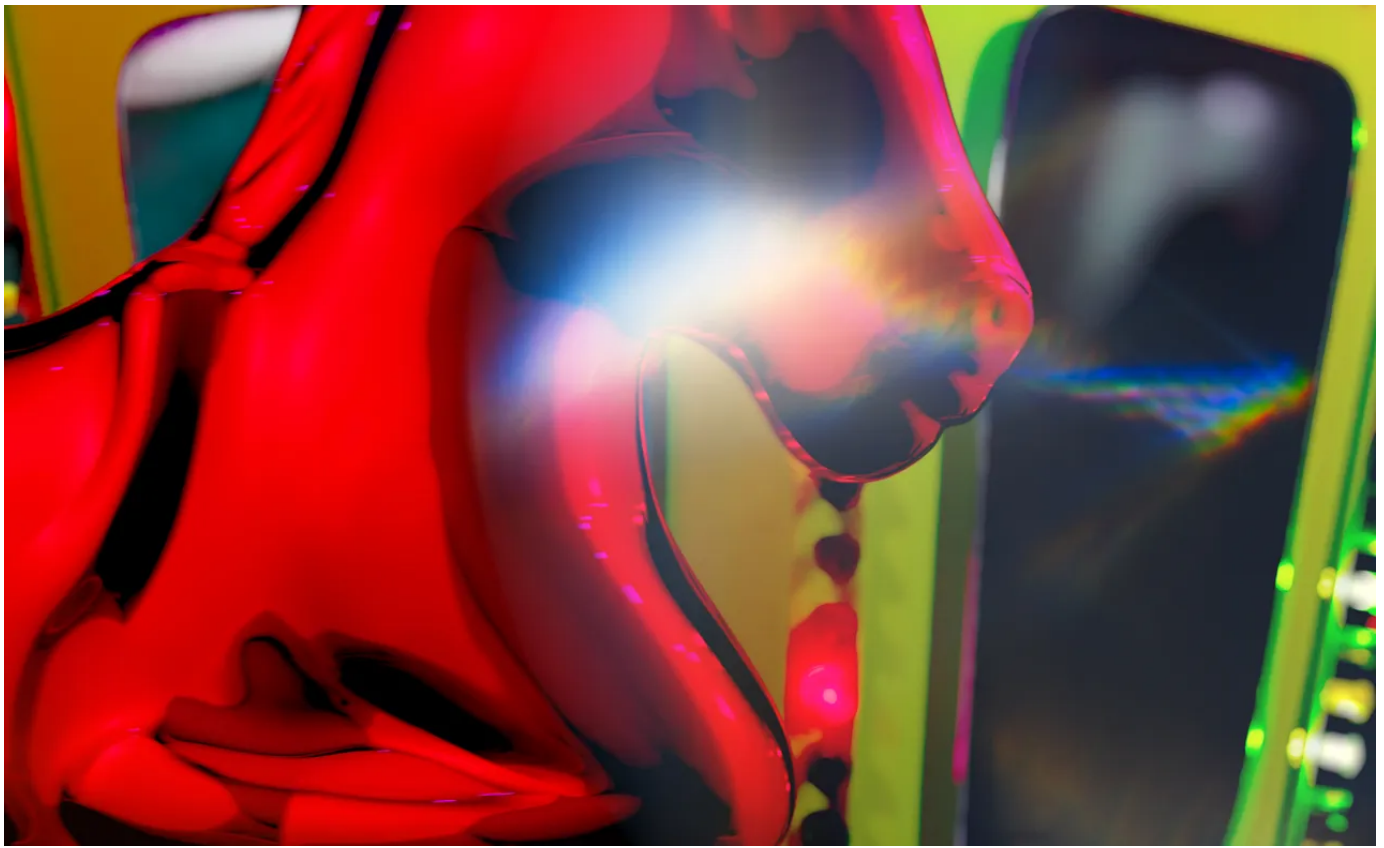
Mark Leckey, DAZLEDDARK , 2023 (production still)