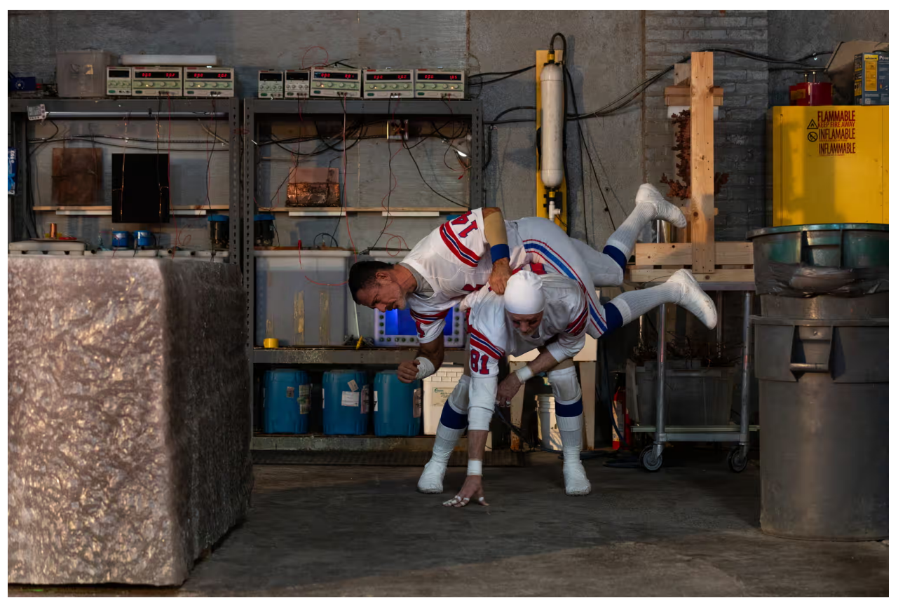
▲ Last line of defence... a still from Secondary, Barney's five-channel video installation re-enacting an infamous 1978 football tackle.

The superstar of the avant garde has revisited a notorious football tackle that left one player paralysed. He talks about violence, ageing and how the US empire is in decline