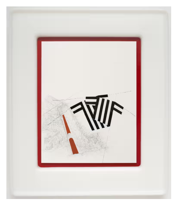
➡ Back Judge (2024), colour pencil, graphite and gouache on paper.

Barney collaborated on an art installation in which the same <u>countdown</u> <u>clock</u> that features in Secondary was placed above New York's East River and ticked off the minutes until the Trump presidency ended. Is Barney worried about what November will bring?